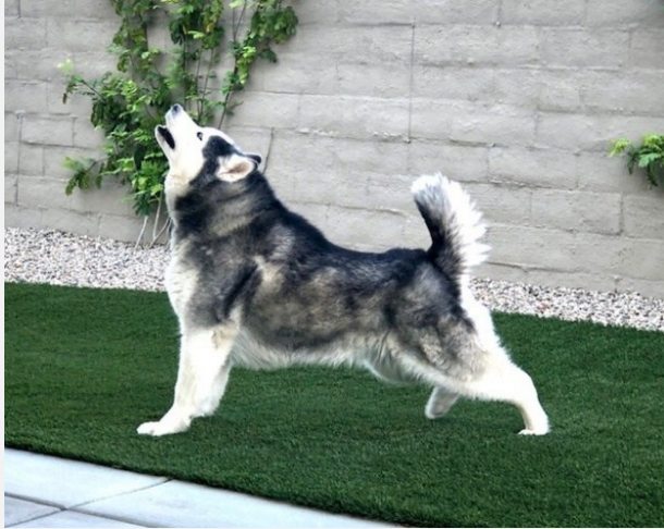
Lilo, our Siberian Husky passed away this year at age 13. She was a rescue and the official Trackdown dog! She loved her Cerritos and Rancho Mirage homes.